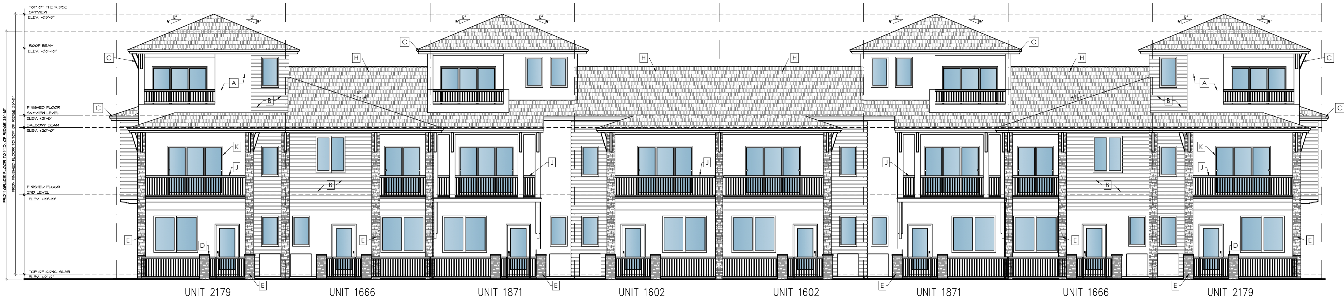
8 UNIT BUILDING LINEAR - FRONT ELEVATION SCALE: 1/8" = 1'-0"

COPYRIGHT © 2020 PASCUAL, PEREZ, KILIDDJIAN & ASSOCIATES - ARCHITECTS - PLANNERS The architectural design and detail drawings for this building and / or overall project are the legal property of and all rights are reserved by the Architect. Their use for reproduction, construction or distribution is prohibited unless authorized in writing by Architect.