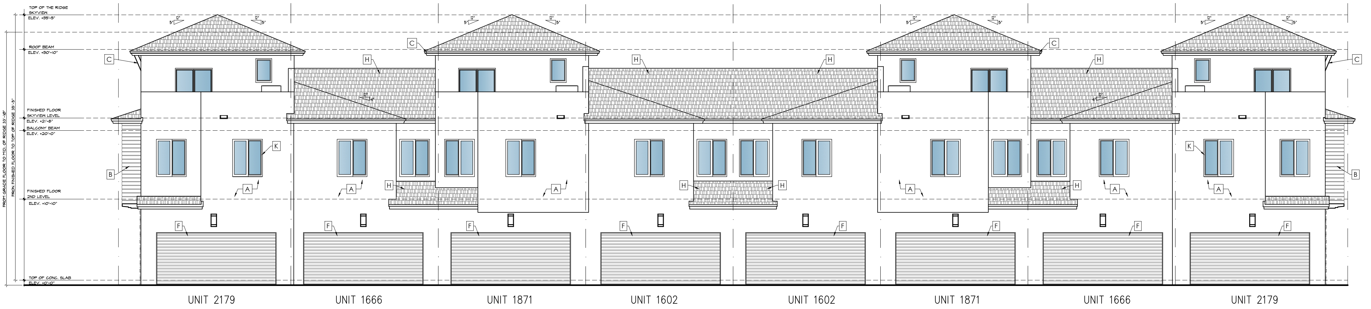
8 UNIT BUILDING LINEAR - REAR SIDE ELEVATION SCALE: 1/8" = 1'-0"